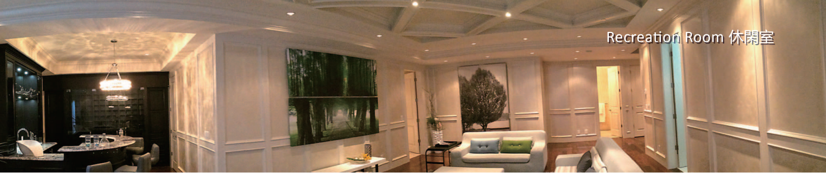
Recreation Room 休閒室